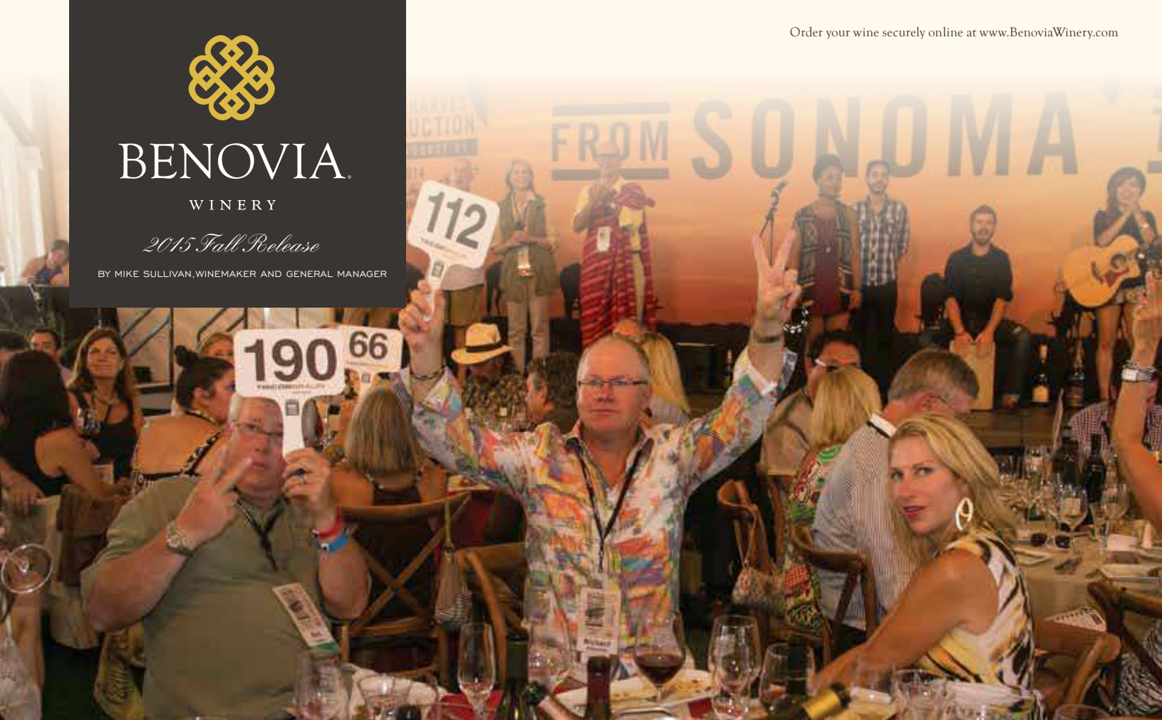
BENOVIA'S TABLE AT SONOMA WINE AUCTION 2014